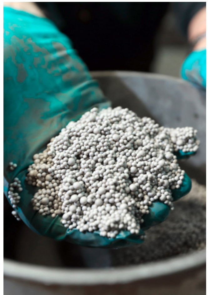
Ceramic grinding media is resistant to abrasion and ideal for stirred milling.

Stirred milling for particle-size reduction utilizes an abrasive-type grinding mechanism. Ceramic grinding media is resistant to abrasion and is an ideal media for stirred milling, especially when compared with steel.