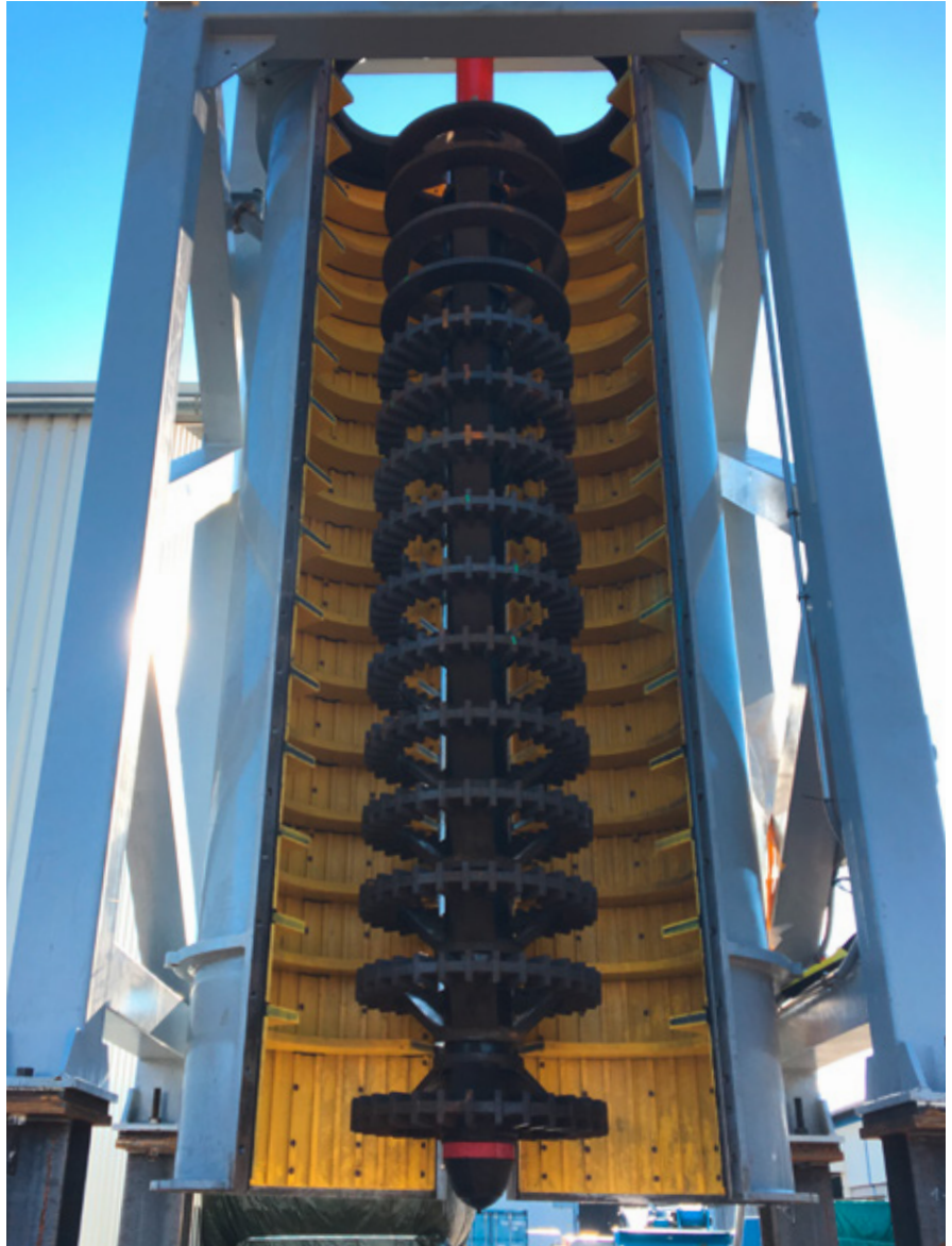
GrindForce’s vaned rotors enable a significant improvement in grinding efficiency to the target grind size.

Compared to conventional flat-surface discs, the vaned rotors also enable a significant improvement in grinding efficiency to the target grind size thanks to the improved media agitation and improved power transfer between the rotor surface and media bead mass.