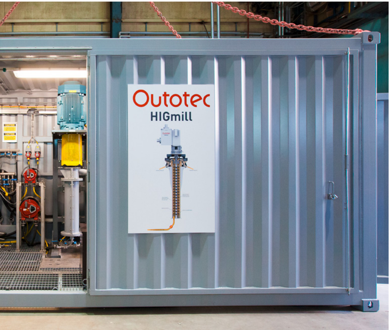
On-site testing is possible with the containerized mobile test unit.